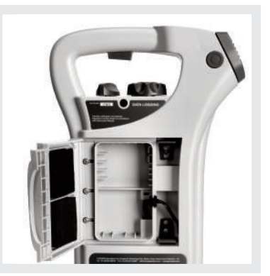
Designed with space to also carry a spare battery pack.

Battery compartment including USB socket