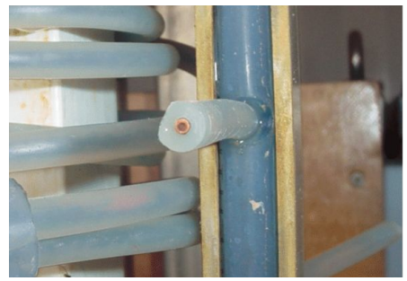
No wear of the tips even after 3 years of use.

broad signal spectrum at suitable power.